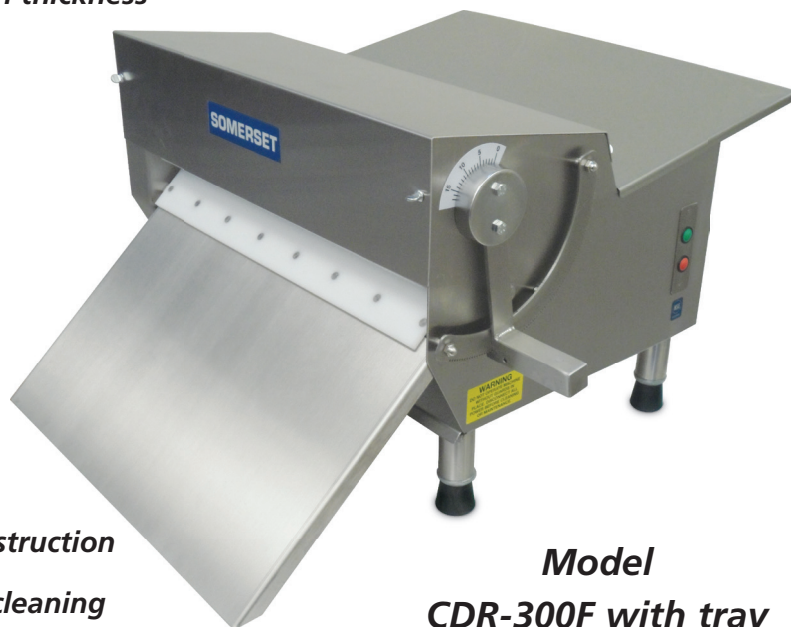
Model CDR-300F with tray