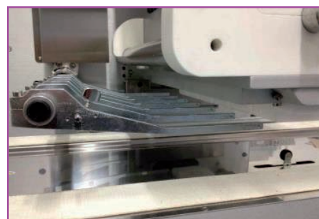
TAGLIO A FILO WIRECUT COUPE A FILE

La nostra politica é di continuo miglioramento e sviluppo. Ci riserviamo quindi il diritto di modificare le informazioni contenute in questo depliant senza nessun preavviso. Our policy is aimed to a constant improvement and development. We therefore reserve the right to amend the information given in this leaflet without prior notice.