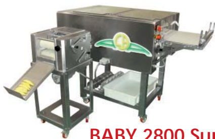
BABY 2800 Super